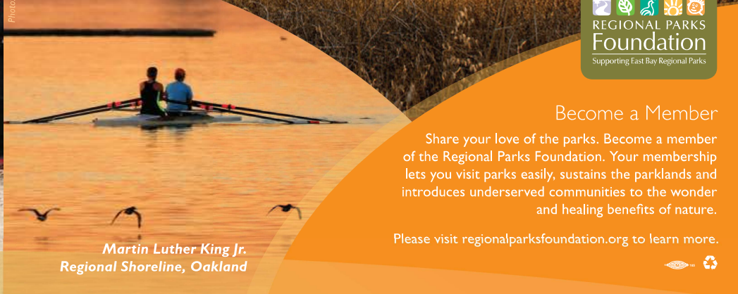
Martin Luther King Jr. Regional Shoreline, Oakland