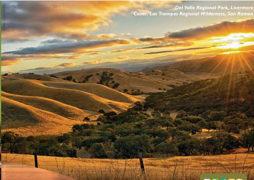
Del Valle Regional Park, Livermore Cover: Las Trampas Regional Wilderness, San Ramon